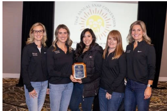
SNAP thanks Geisinger for being our CHAMPION Sponsor at the 2024 Convention and presented a special plaque to honor their commitment to our organization.